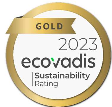
Figure 1. Our EcoVadis Gold rating places us in the 97 th percentile for sustainability

We at Tialis are committed to safeguarding our planet for future generations by reducing our impact on the environment. This carbon reduction plan outlines how we intend to achieve this. We have committed to a well-below 2 degrees Celsius trajectory and to maintaining our scope 1 and scope 2 greenhouse gas emissions at least 30% below those in our base year of 2018. We have also invested in an environmental management system certified to ISO 14001 to ensure that we can monitor and manage our activities to meet our targets.